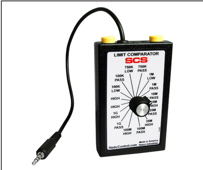
Figure 1. SCS 770751 Limit Comparator